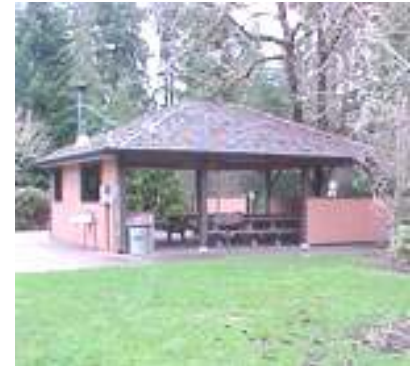
The Rose Garden Picnic Shelter