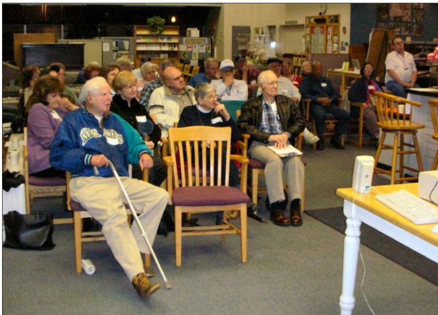
OMUG general meetings are held the second Thursday of each month, with a Meet & Greet at 6:30 p.m. and the meeting at 7 p.m.

Don't forget the general meeting Feb. 9 begins with a "Meet & Mix" at 6 p.m., with coffee, cookies and hopefully good fellowship. The general meeting starts at 7 p.m. Beginning this month, we will start with OMUG business and a short question and answer session before the evening's presentation starts. I hope to see you there.